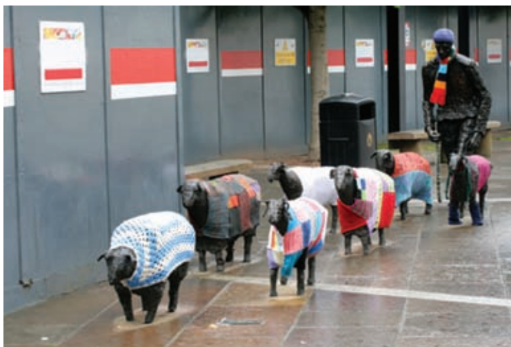
Above / Yarmbombing.

Another potential pitfall is the assumption that to embrace 'Slow' is to deny modernity. This is not a return to that poignant old seventies dream of moving down the country and making things out of wood. In fact most of the work in Taking Time is decidedly contemporary and, ►