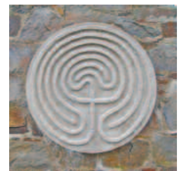
Below / Detail from cast concrete sculptural piece by Oisín Kelly at Burt Chapel (1967)