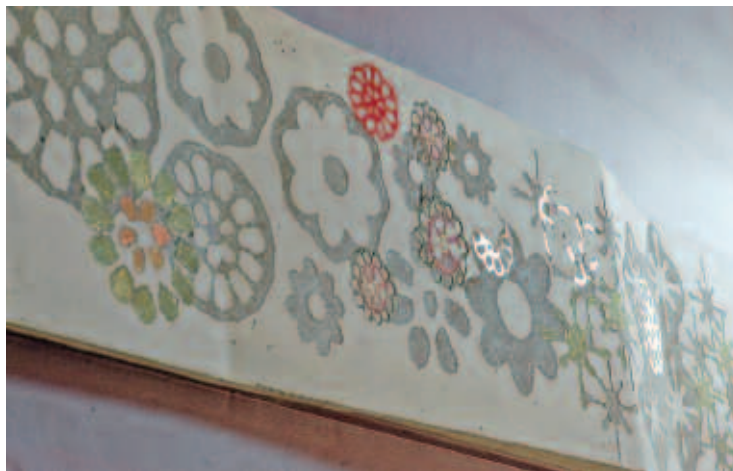
Below / Section of Playhouse panel.