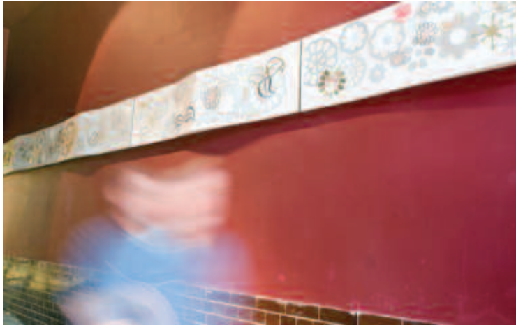
Above / Playhouse panel