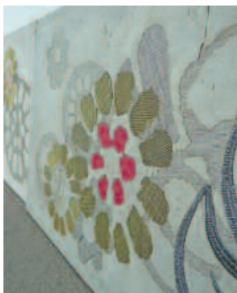
Above / Detail of stitch in the Playhouse panel