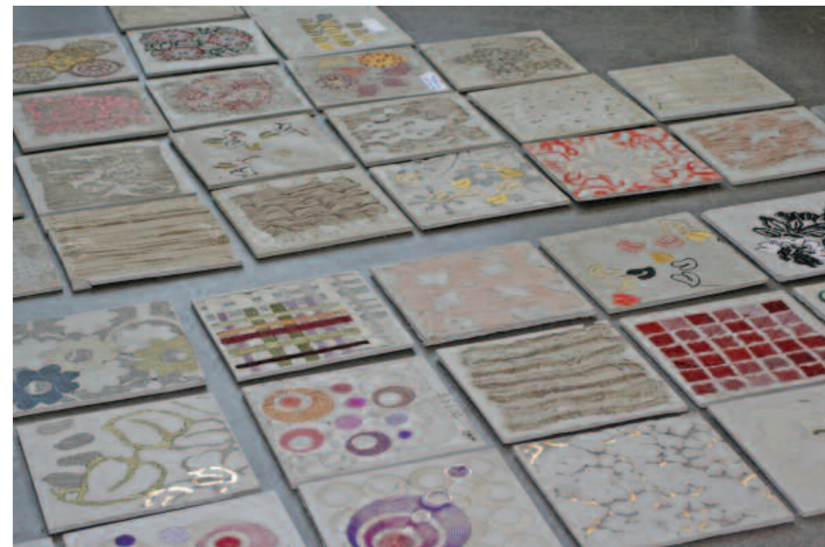
Above / Work in progress for the Playhouse

Vermillion red, deep crimson, gold leaf, silver, beige, off-white, and tones of grey motifs are layered onto the continuous piece of loosely woven linen that runs through the piece, within the concrete. 'Flock' like motifs are reminiscent of heavy Victorian wallpapers in homes and theatres. The big surprise is that most motifs are much more than cut out shapes. Many are comprised of gold, crimson and silver yarns that seem stitched onto the concrete, like appliqué or embroidery, but instead have been cast integrally. ►