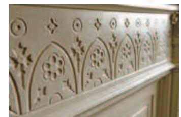
Above / Inspiration for some of the motifs taken from the original fireplace in the Playhouse.